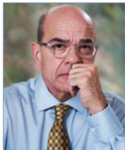
ROBERT PICARDO “DR. ALAN PETERSON”